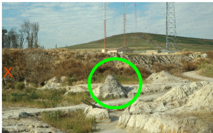
Photo below shows overview of pit in 1989; circle shows feature known as "The Pedestal" that is enlarged in second photo. Corals for TIMS U-Th dating were collected from a site just to the left of the red X, from a unit equivalent to aminozone IIa as seen below.

"The Pedestal" circled in green in above photo.