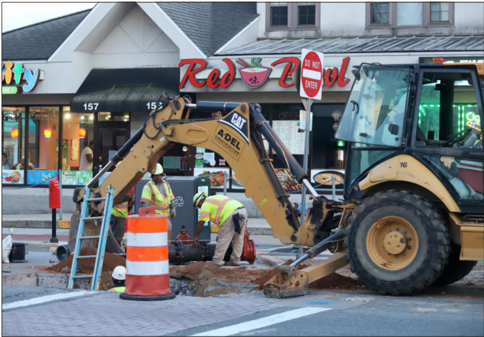
A crew begins to replace water mains on Main Street on Sunday evening, a project that prompted several restaurants to close Monday.

The advisory is a precautionary measure because