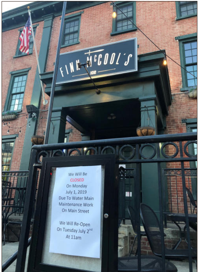
Finn McCool’s Irish Gastropub was closed Monday due to a boil-water advisory.

“We apologize for any inconvenience; however, we are taking every precaution necessary to remain open to our community while others have chosen to close their doors,” Panera management wrote in a notice