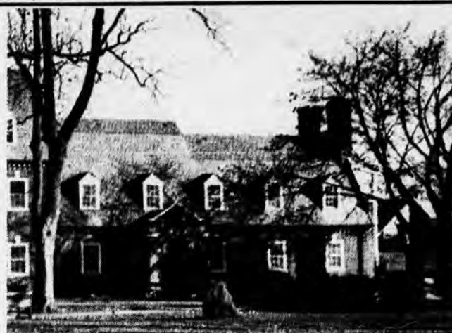
THIS NORTH CAMPUS Male abode was housecleaned by Sig Ep pinmates last weekend, who even took overnights in the fraternity house.