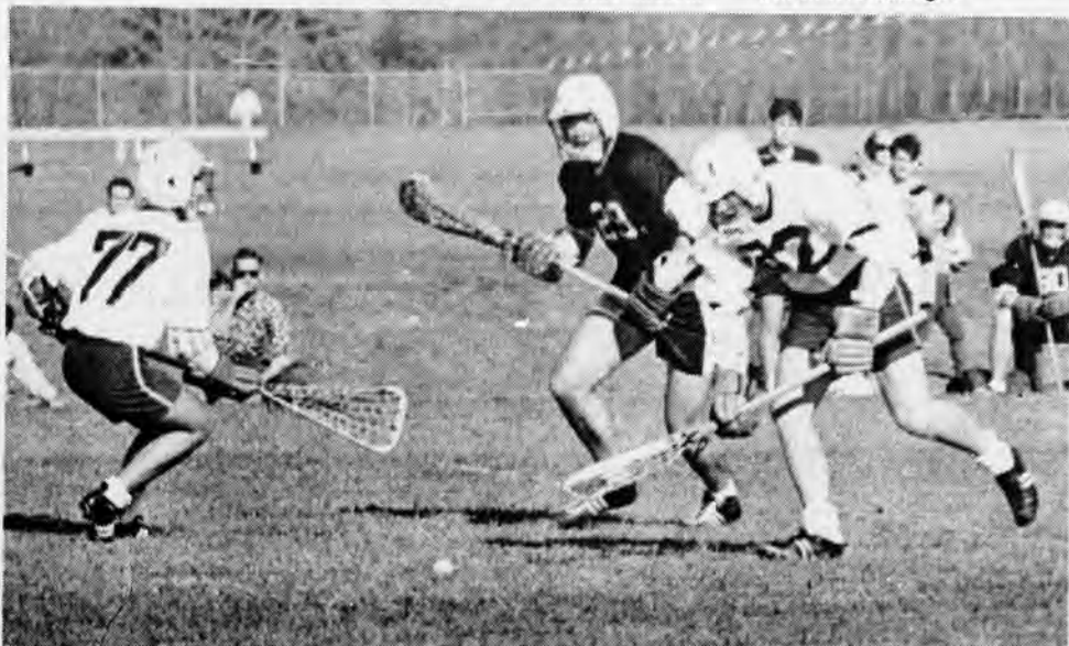
GET THAT BALL - Delaware players outmaneuver a lone Swarthmore opponent and move toward the elusive ball. Swarthmore defeated the Hens 8-6 last Wednesday.

Thursday the freshmen had a return match with Bainbridge NAPS whom they ripped 9-0 earlier at Bainbridge. Tomorrow the varsity plays Ursinus at 2 p.m. in a home match.