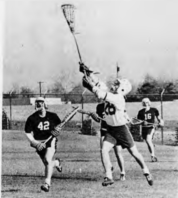
HIGH AND MIGHTY - Delaware player stretches high into the air to pass the ball to a teammate away from onrushing opponents.

the range. Hopefully Saturday's effort against Lafayette will bring better results. Game time will be 2 p.m. on the Delaware lacrosse field.