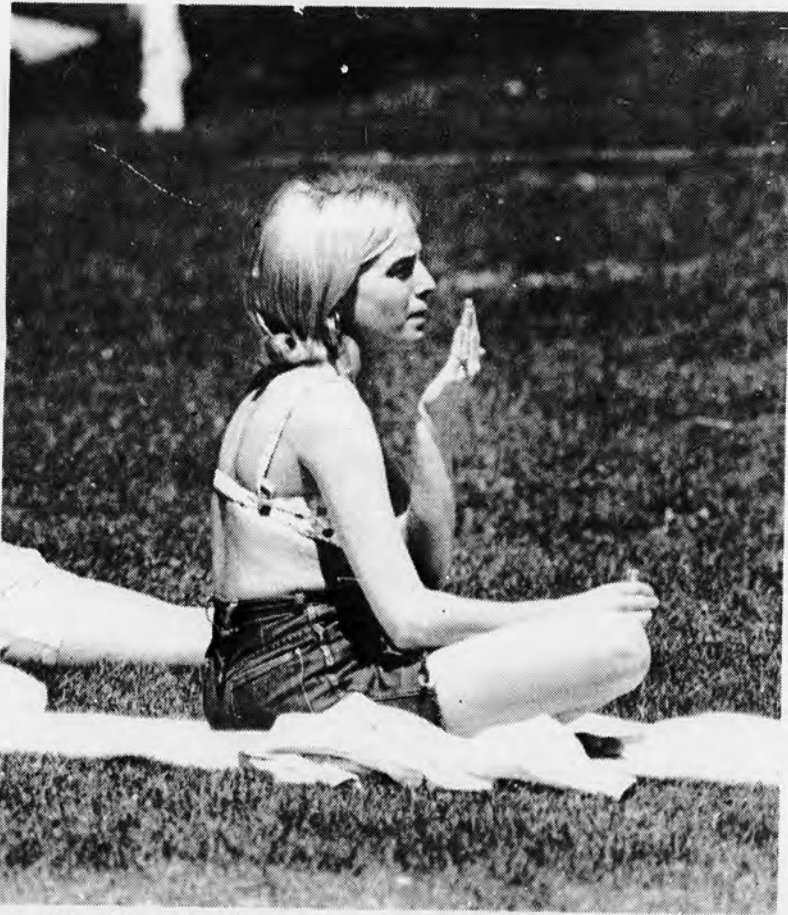
"Hey this stuff smells pretty good, I wonder what it tastes like?"