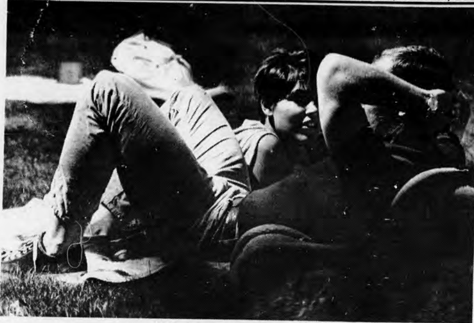
"I think someone is watching us."