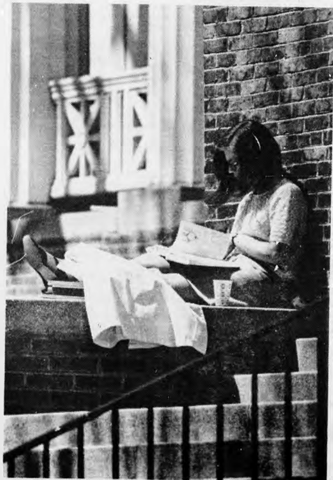
". . . and I've only got ten minutes before that hourly."

men ear ly and is ric d w d to p c the to s s a be th g w le in vi so wh pe st wa fe Th It al pl of pu a m so re se to na we ve ed fo in gr an 15 ce