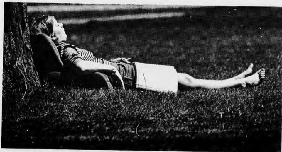
"I've got it now: shorts plus sun equals tan."