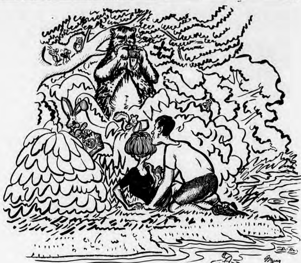
"At The Creek"

National newspaper advertising sales handled through the National Educational Advertising Services, 360 Lexington Ave., New York, New York 10017.