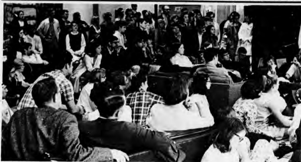
OVERFLOW CROWD SILENTLY GATHERS for 12:30 p.m. presentation of dramatic readings titled "Is Violence the Nature of America" in the lounge of the Student Center last Monday.