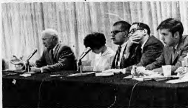
PANEL OF PROFESSORS discuss race relations at forum sponsored by the Republican Platform committee of the Mock Convention.

There is a similar forum planned on Vietnam by the Mock Convention committee. The forums, in addition to serving as seminars, will contribute to the writing of the Republican platform for the convention May 4.