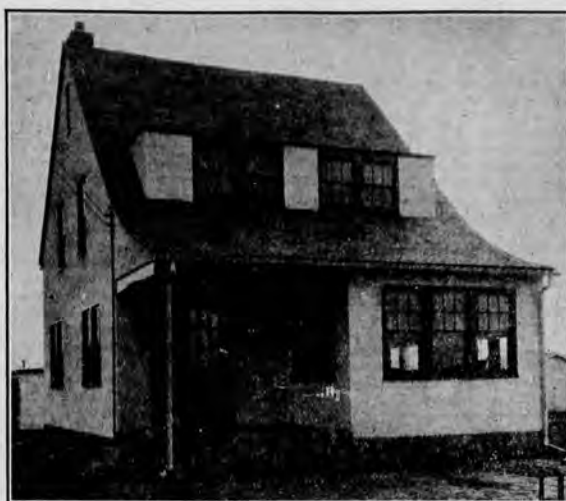
Structure, In English Colonial Design, Occupies Fine Site Near New School