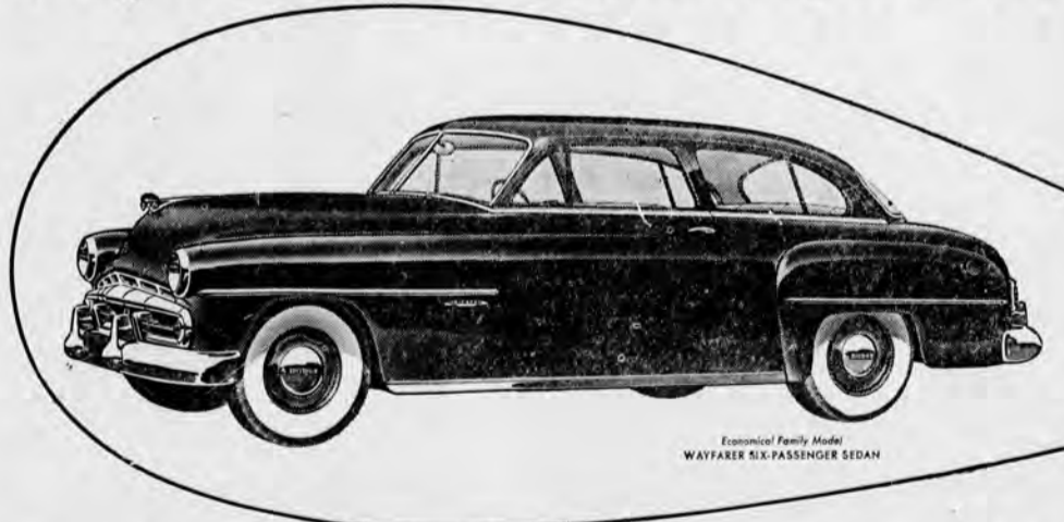
Economic Family Model WAYFAKER SIX-PASSENGER SEDAN

You get the facts you need to judge car value.... and save money!