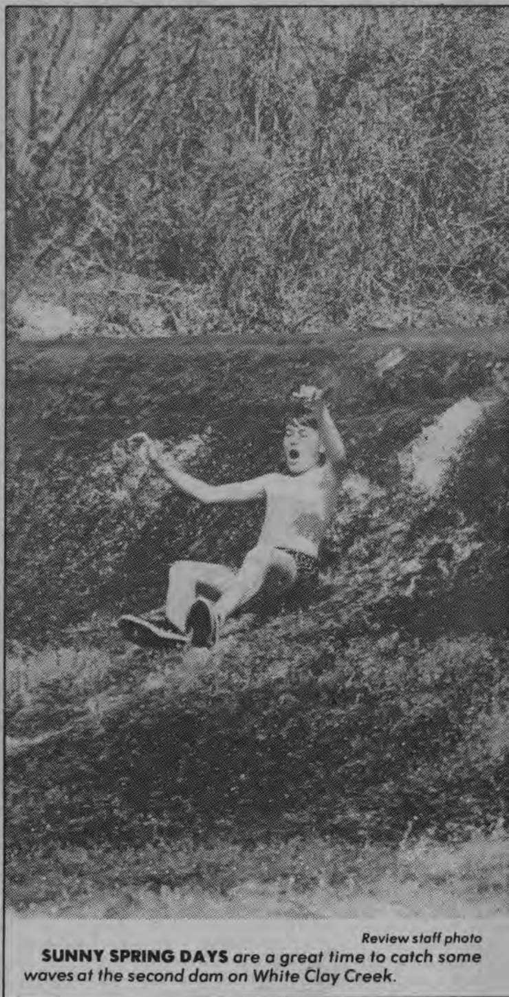
Review staff photo SUNNY SPRING DAYS are a great time to catch some waves at the second dam on White Clay Creek.