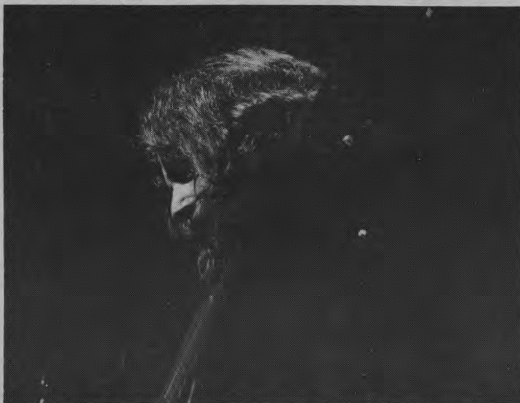
BYRDS--Roger McGuinn provides chords on his twelve string guitar for the Byrds concert last night.