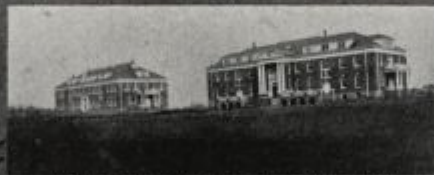
Women's College of Delaware