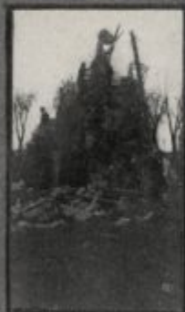
Bonfire to night