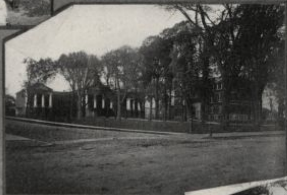
Corner of Campus