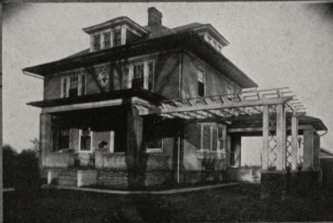
Home of President