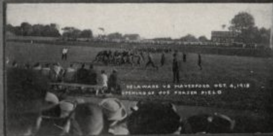
DELAWARE VS HAVESFORD OCT 4, 1912 OPENING AT 4:05 FRAZER FIELD