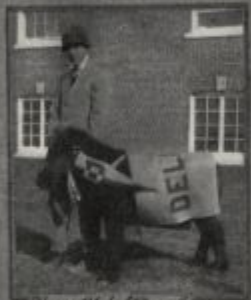
The Old 'Pep'