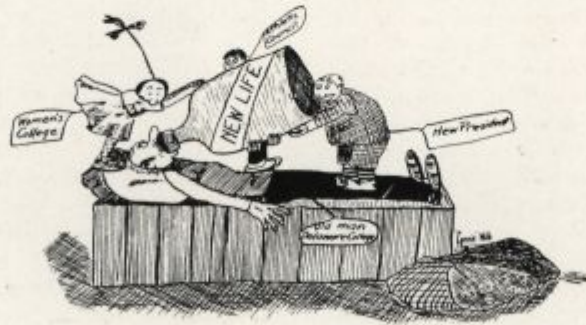
DELAWARE COLLEGE HAS AN AWAKENING.

after valiant duty fell by the wayside. All have performed high and worthy service and sincere gratitude is due them. Also to the men who have laid the foundation stones, who have cemented the bricks and driven the nails, all honor to them for their integrity of workmanship and their steady industry. If obstacles came in our way, that was but natural in the course of human events; it was for us to rise above them, to mount the step higher and attain the supreme end. This has been achieved, citizens of the State; behold here stands for the years to come that which we dedicate, with the blessings of God, your Women's College of Delaware.