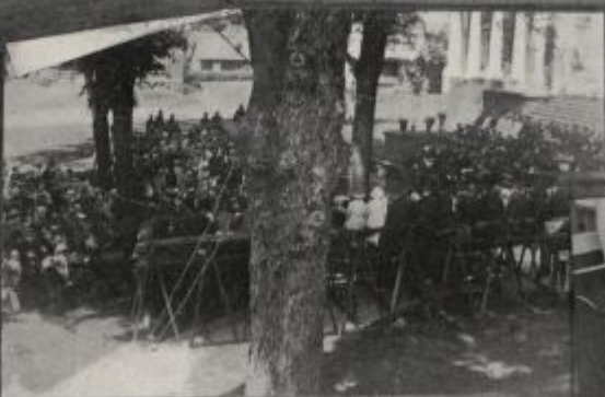
1913 - Commencement Exercises