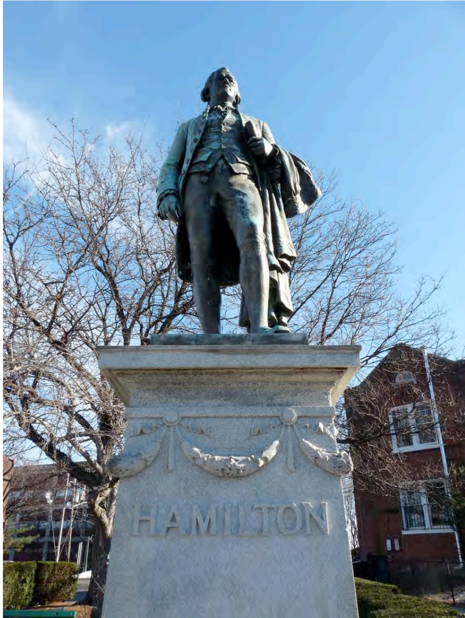
Figure 2.2 Statue of Alexander Hamilton located east of the Great Falls in Overlook Park; erected in 1967 in celebration of the Great Falls Natural Landmark Designation.