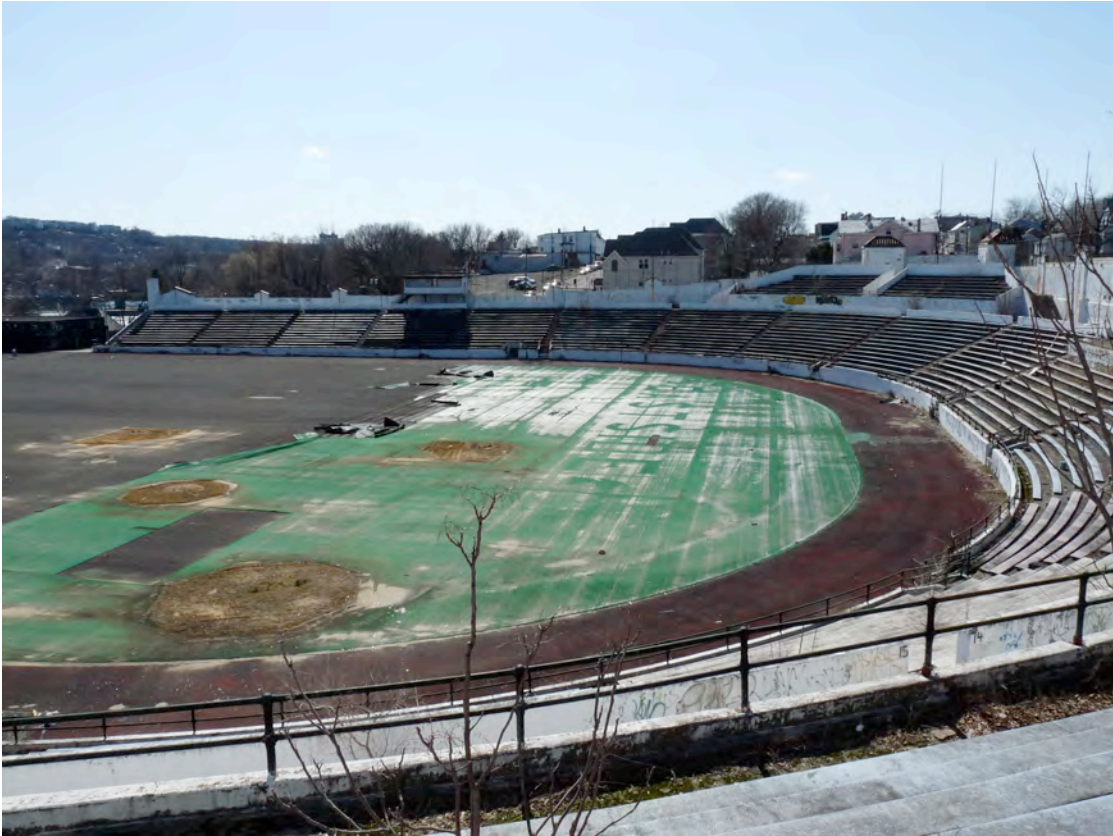
Figure 4.10 View of stadium playing field from bleachers