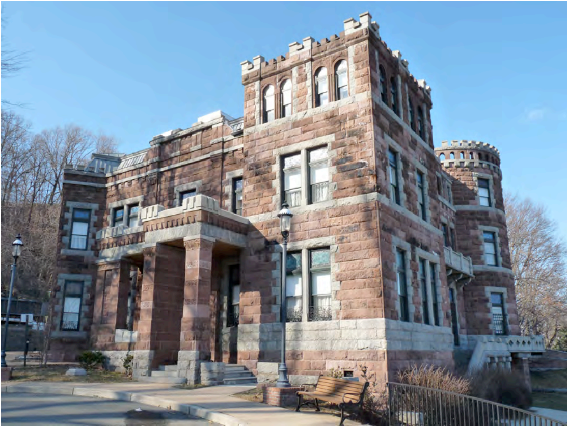
Figure 5.4 View of Lambert Castle located on Garrett Mountain, overlooking the city of Paterson