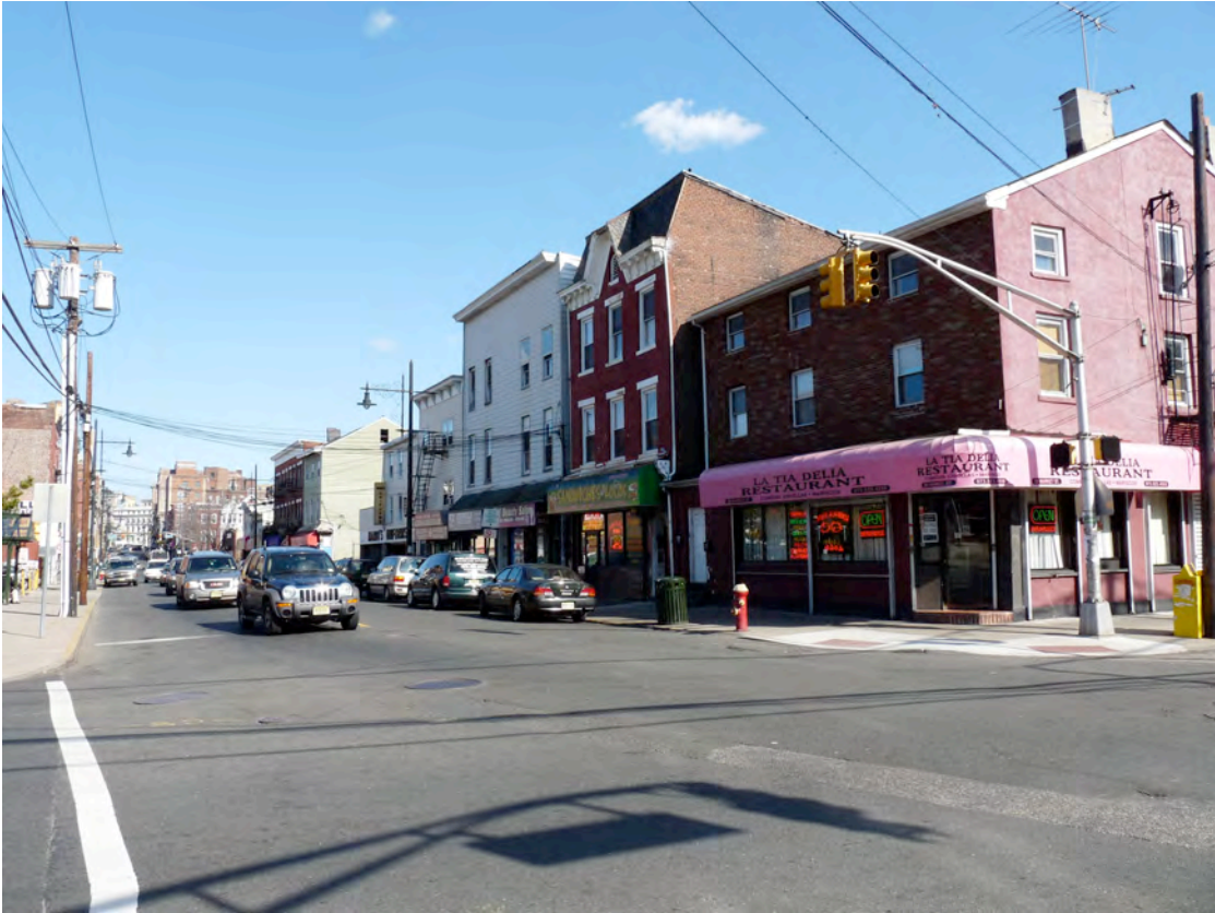
Figure 4.4 View of intersection at Market and Mill Street