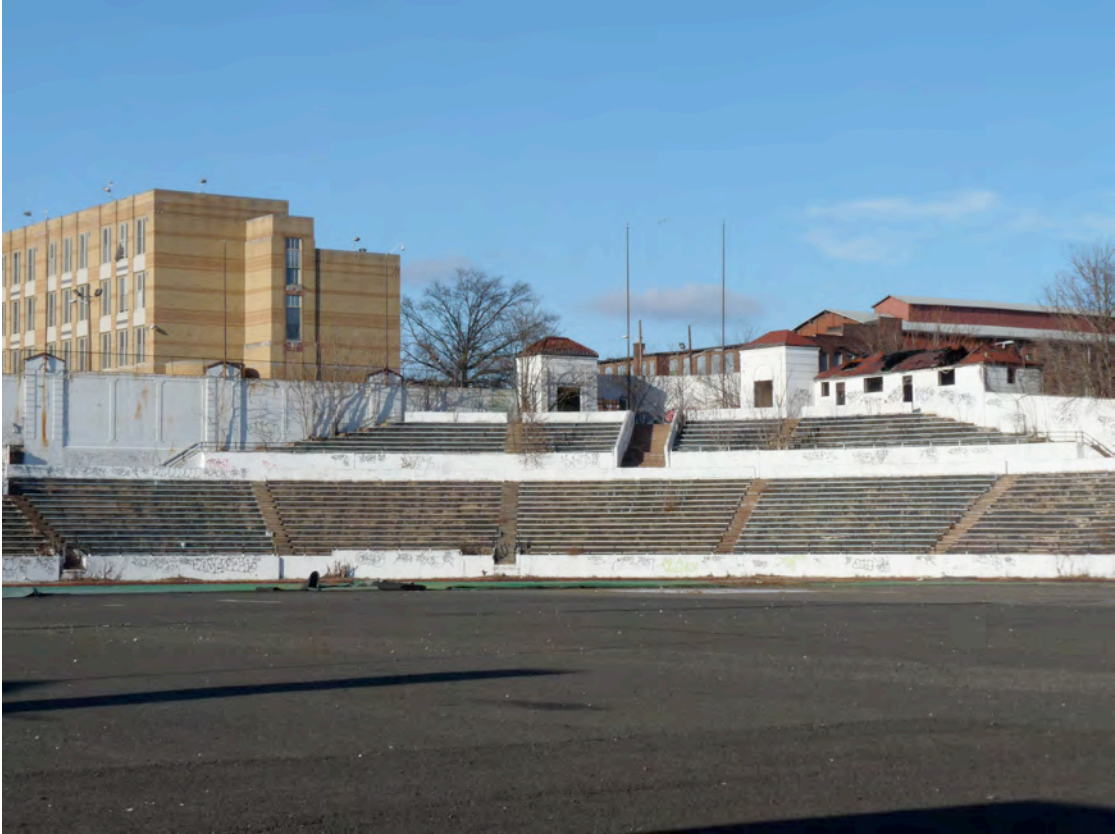
Figure 4.9 View of stadium bleachers from playing field