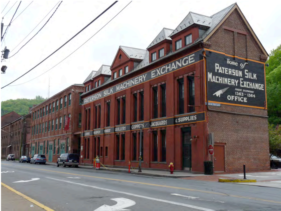
Figure 2.3 View of historic mills on Spruce Street that have been adaptively reused as a school and office space