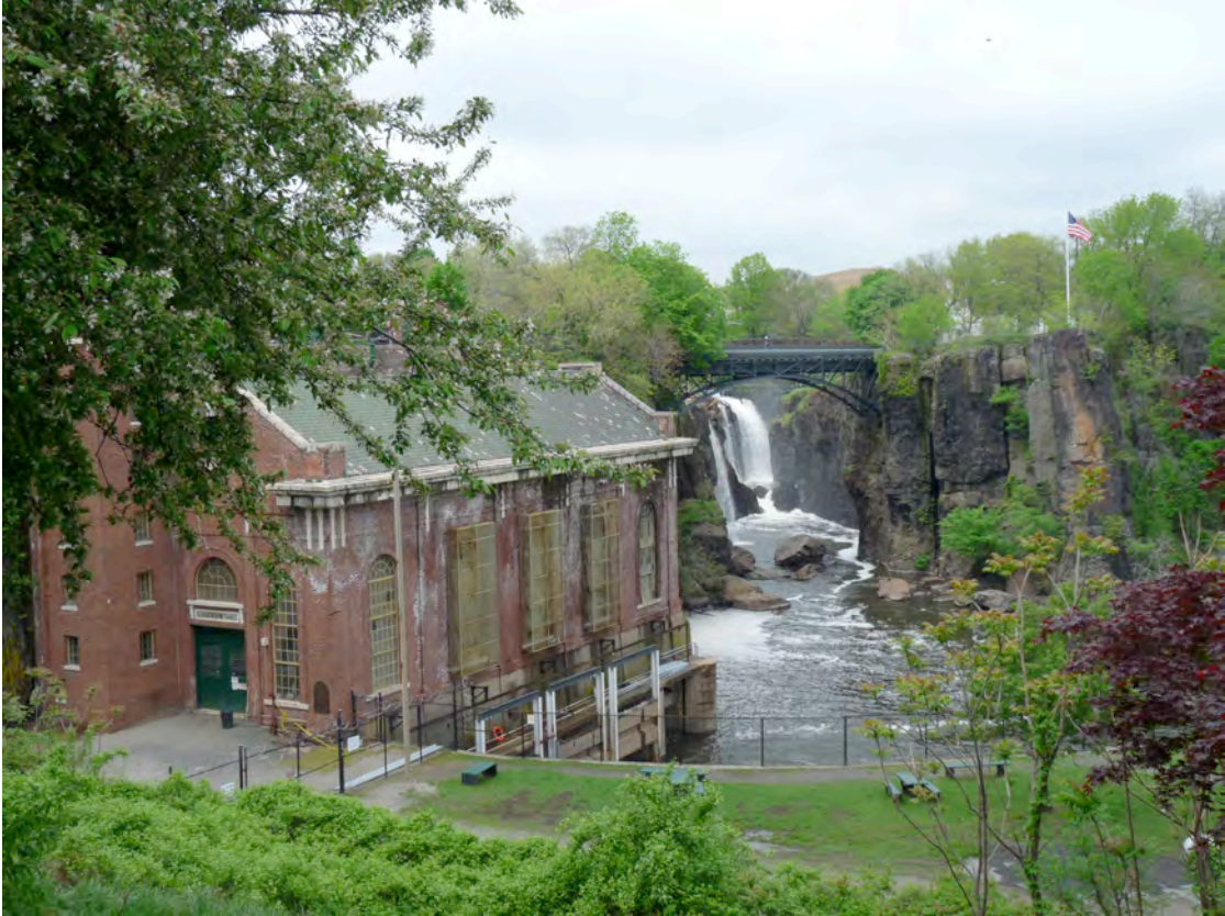
Figure 1.1 View of Great Falls and the Hydroelectric Plant