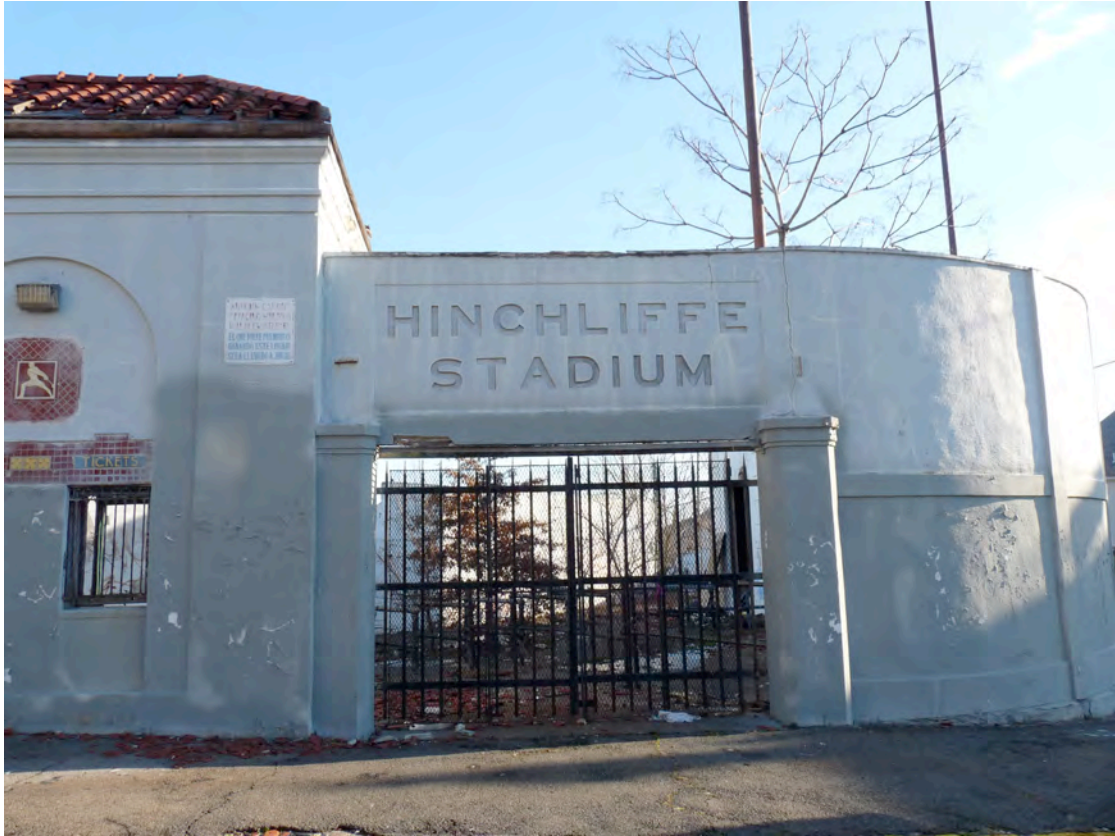
Figure 4.6 View of north entrance of Hinchliffe Stadium