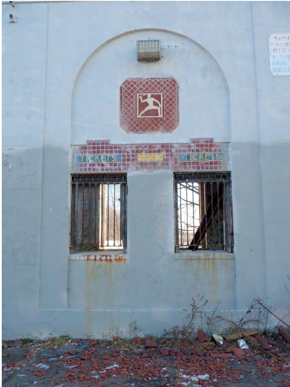
Figure 4.7 Detail of ticket booth of Hinchliffe Stadium showing deterioration of terracotta roof shingles on sidewalk