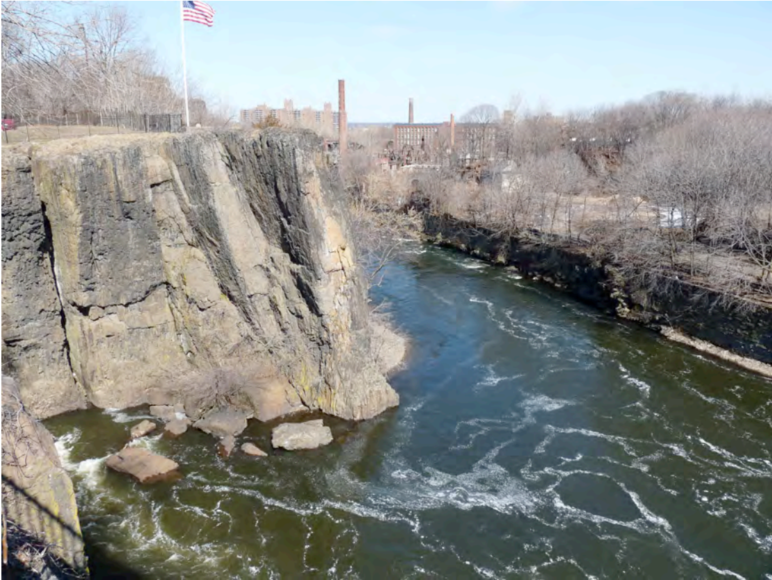
Figure 2.8 View of Great Falls Basin showing Allied Textile Printing site in distance