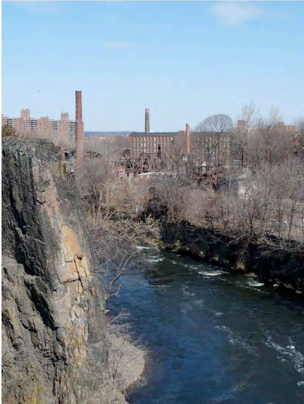
Figure 2.9 View of Allied Textile Printing Site from the Great Falls