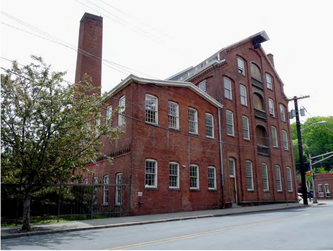
Figure 2.4 View of the Roger's Locomotive Works which has been rehabilitated and used as a museum and office space