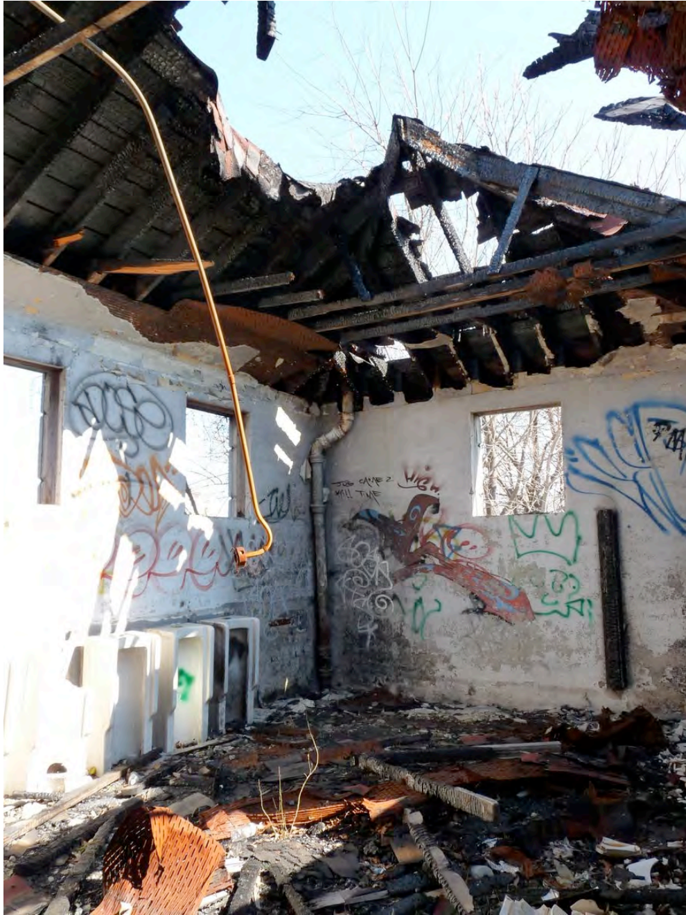
Figure 4.8 View of former restroom, showing the extent of deterioration and vandalism