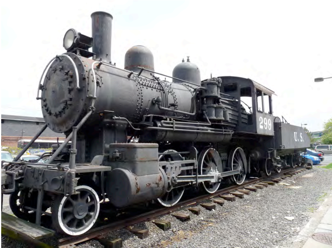
Figure 5.2 Engine 299 is displayed outside of the Paterson museum. It was used in the construction of the Panama Canal and was returned to Paterson in the 1980s through efforts by former Mayer Lawrence Kramer