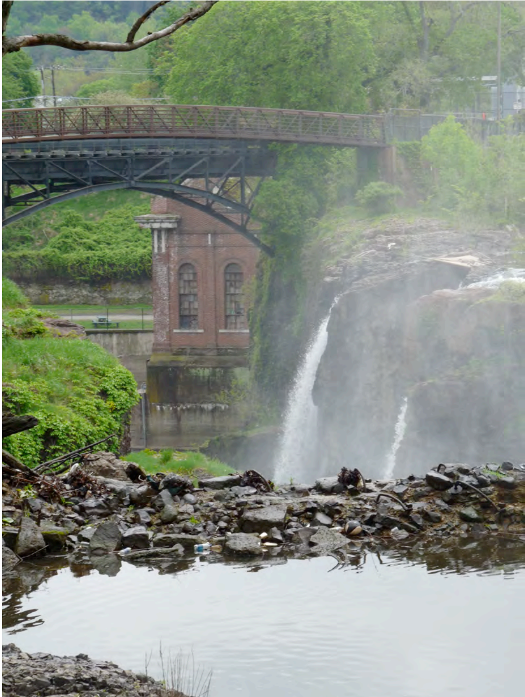
Figure 1.3 View of Great Falls, pedestrian bridge, and Hydroelectric plant