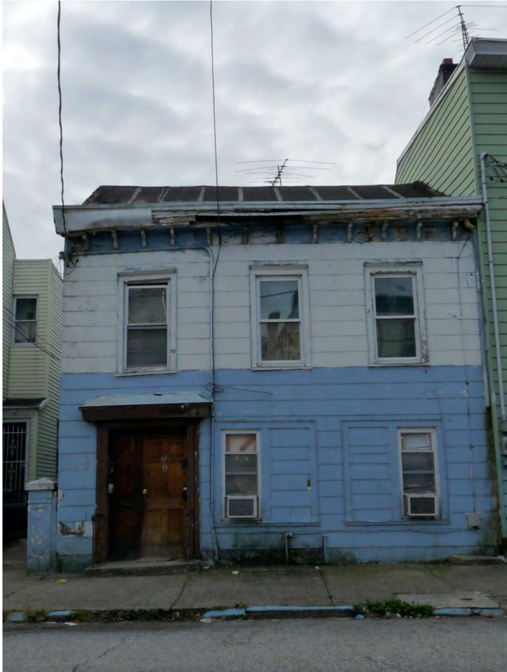
Figure 4.3 Front elevation of dwelling on Elm Street