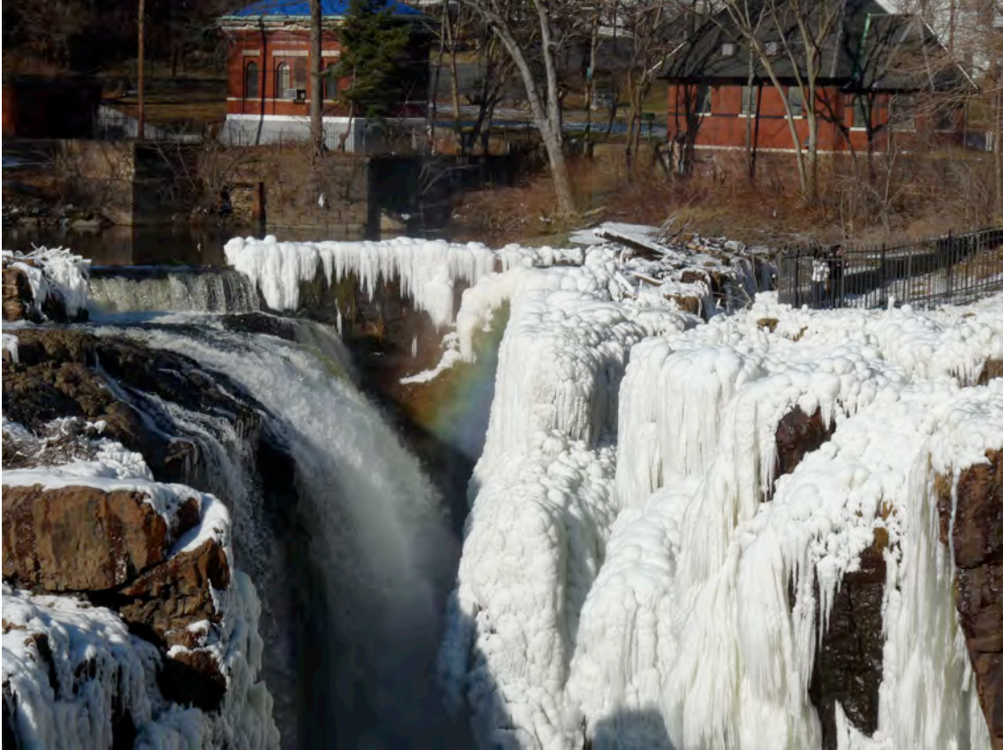
Figure 5.6 View of frozen falls