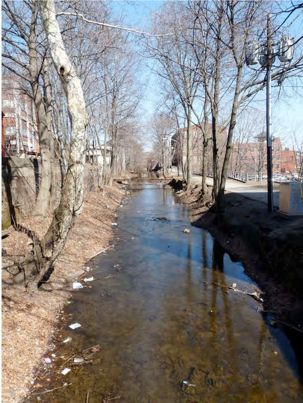
Figure 2.6 View of middle raceway