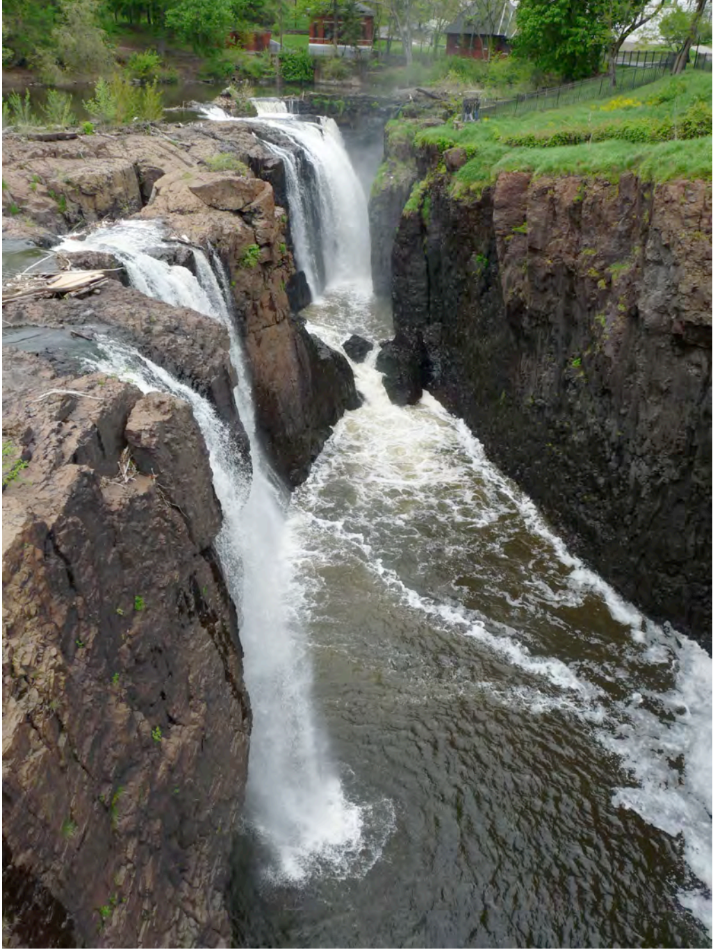
Figure 1.2 View of Great Falls from pedestrian bridge