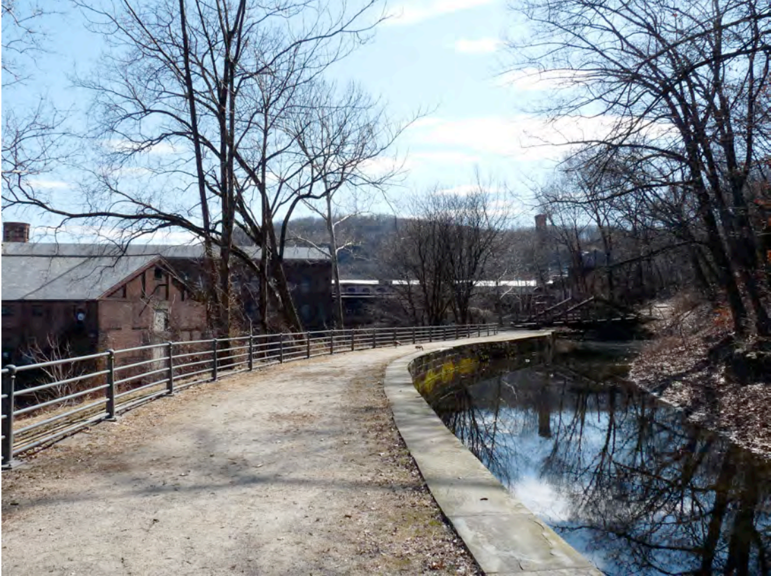
Figure 2.5 View of pedestrian trail located along the upper raceway