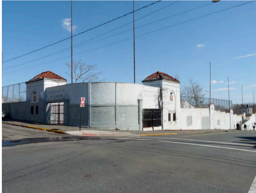
Figure 4.5 View of Hinchliffe Stadium