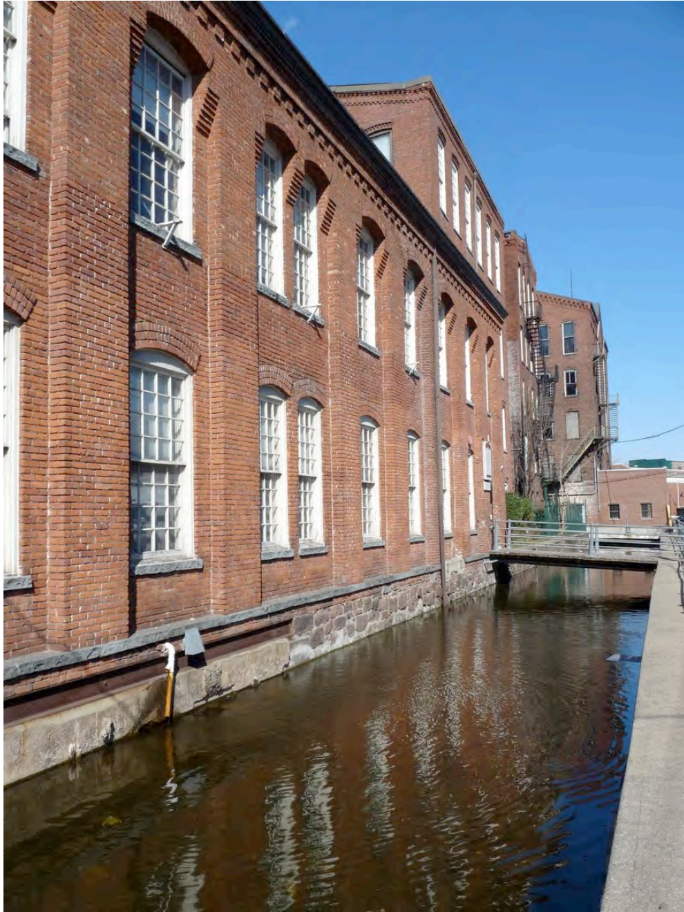
Figure 2.7 View of mill along middle Raceway on Van Houten Street that has been rehabilitated into housing