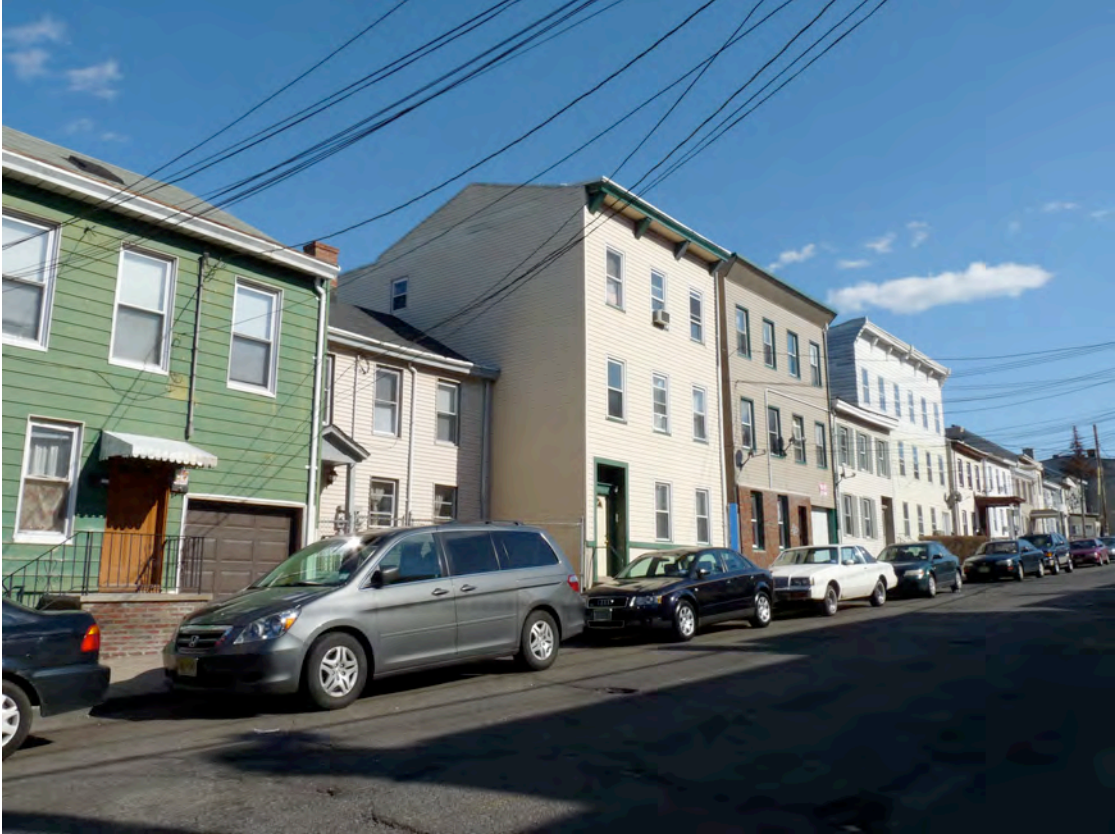
Figure 4.2 Typical Housing found in southern section of “Dublin” on Mill Street