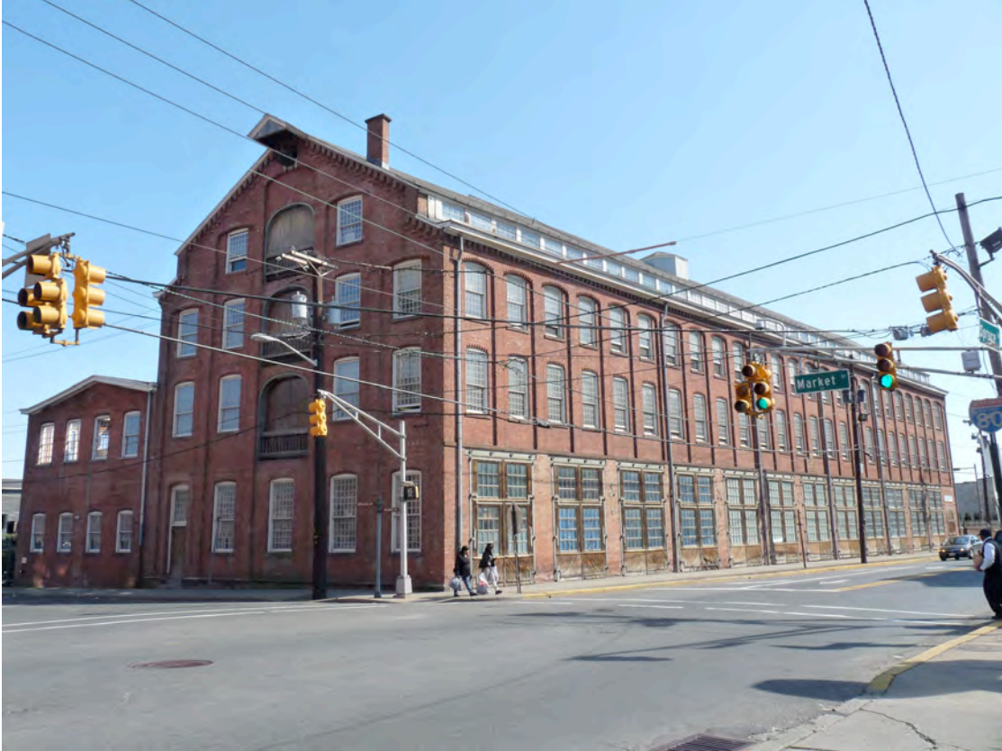
Figure 5.1 Exterior view of the Paterson Museum, formerly the Rodger's Locomotive Works, located on the corner of Market and Spruce Street