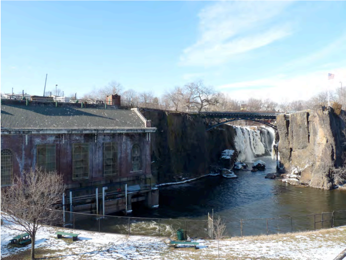
Figure 5.5 View of Great Falls and Hydro-electric plant in winter