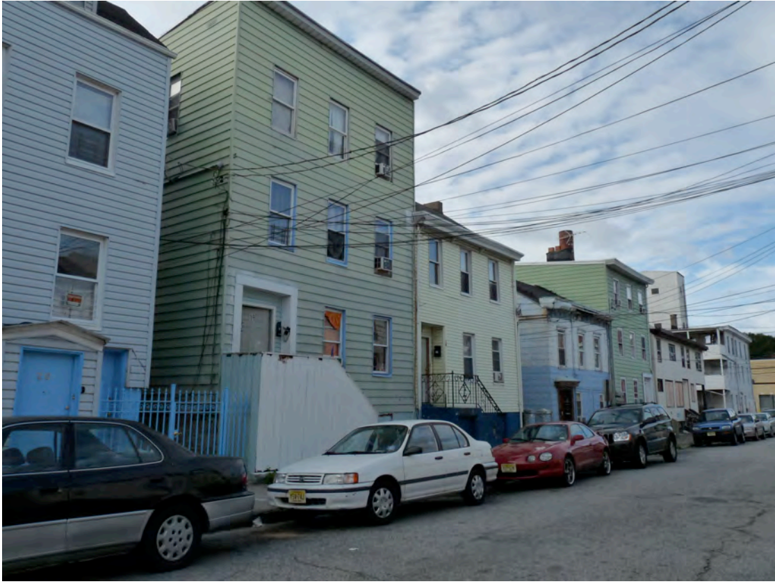
Figure 4.1 View of housing on Elm Street in “Dublin”