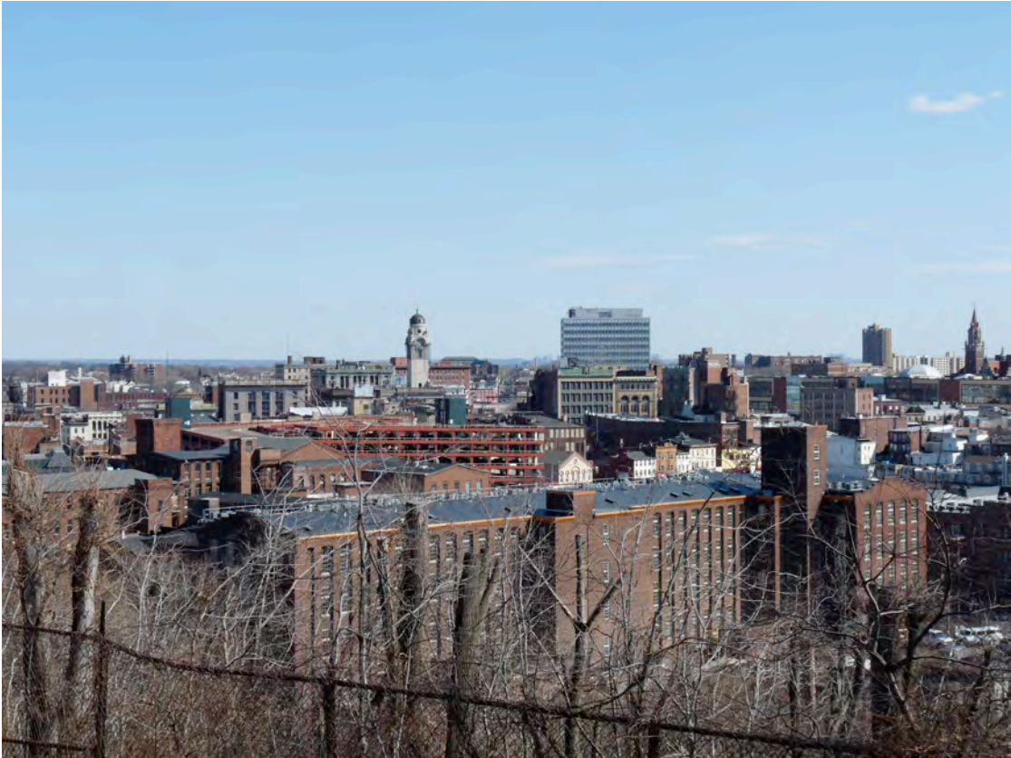
Figure 1.5 View of Paterson skyline