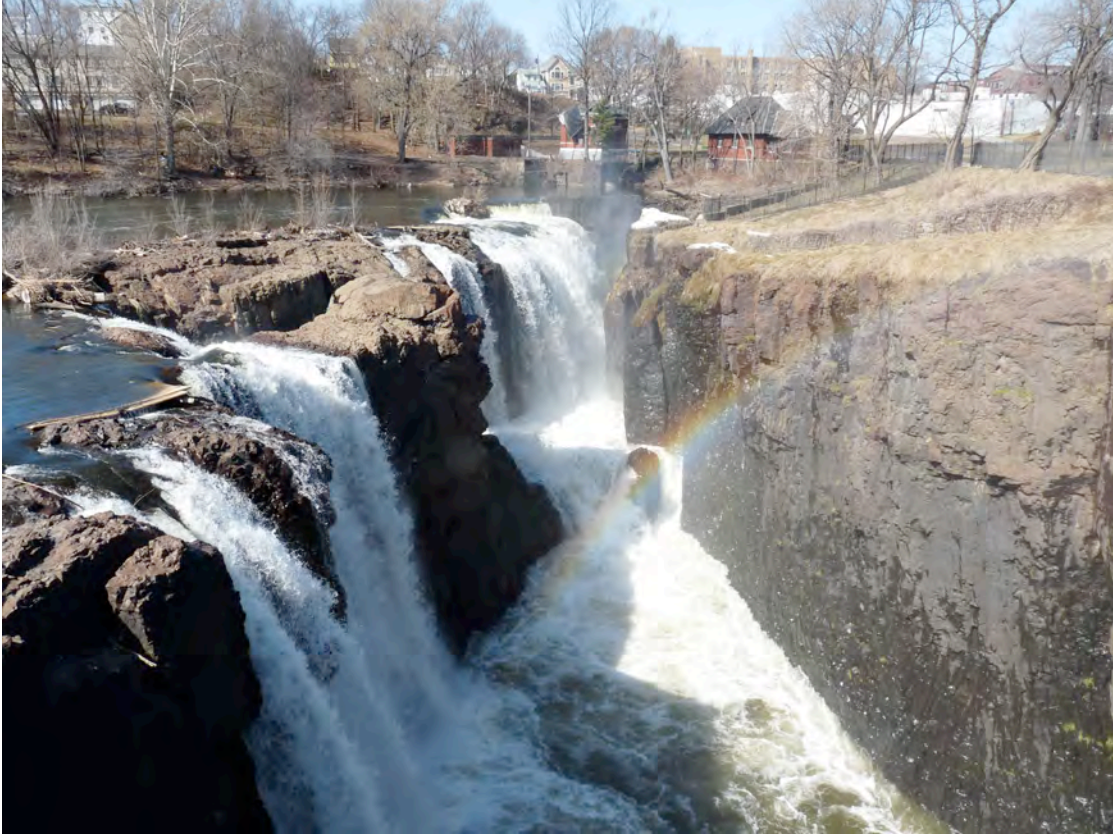
Figure 1.4 View of Great Falls from pedestrian bridge