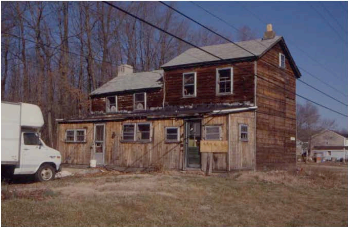
Figure 76: Joseph Crawford House, view of south and east elevations looking northwest.